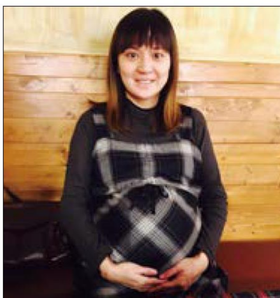
2016.4 ：生產前一天 飲食及胎兒發育正常

“Find a way of life” writed by a member who suffered from RDEB